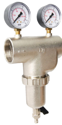
with Pressure Gauge and M/M Union Kit

It's system can conveniently be installed unto your waterline system in just a couple of minutes. Aquafiltro's design lets you flush out filtered sediments with just a flick of the lever.