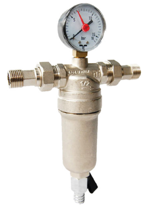
with Pressure Gauge and F/F Thread